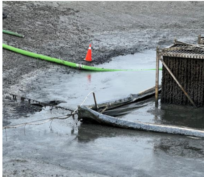
Biocord™ Lagoon Effluent Sampling