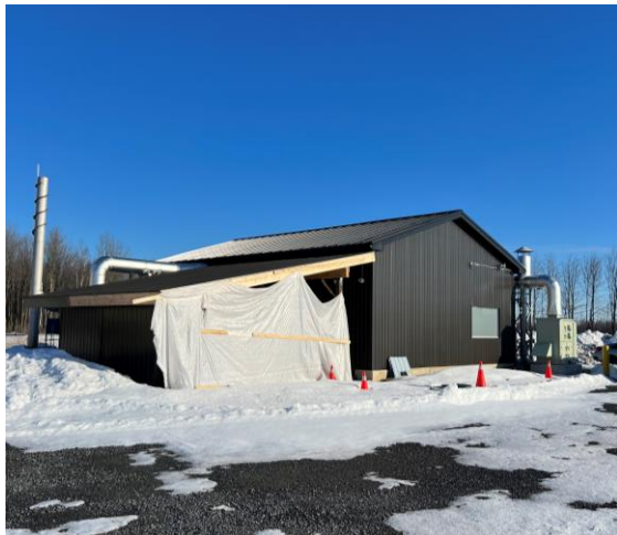
Covered Grit Removal