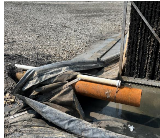
Alum line repositioning to effluent of lagoon