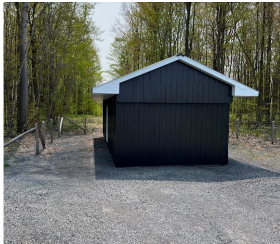
Covered UV Disinfection