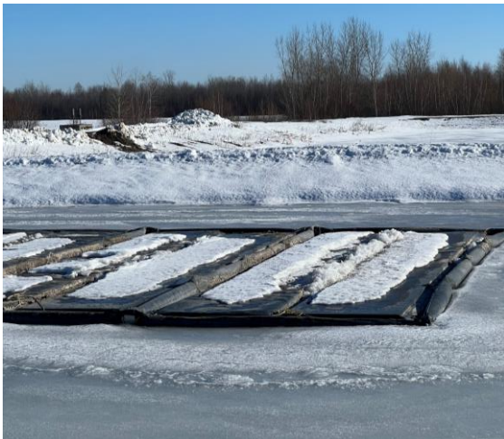
Covered East Biocord™ Lagoon